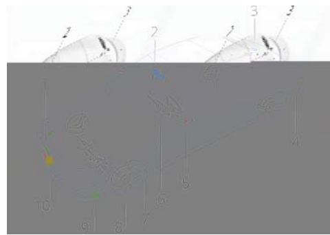
Fig. 1. Sensor setup of the Mercedes S-Class with the “Drive Pilot” 12 . The numbers are labeled as follows: 1) front long-range radar: opening angle 90^\circ / 9^\circ , 2) stereo multi-purpose camera: opening angle 70^\circ , 3) rear multi-purpose camera: opening angle 50^\circ , 4) ultrasonic sensors: 12x opening angle 120^\circ , 5) 360°-camera: 4x single cameras with opening angle 180^\circ , 6) driver camera, 7) moisture sensor, 8) redundant electrical brake and steering system, 9) multi-mode radar: 4x opening angle 130^\circ , and 10) lidar: opening angle 120^\circ .

Nevertheless, developers have different approaches when it comes to picking the necessary hardware for autonomous driving systems. When considering the recently approved level 3 automated driving system of Mercedes, a total of 27 sensors are used as shown in Fig. 1.