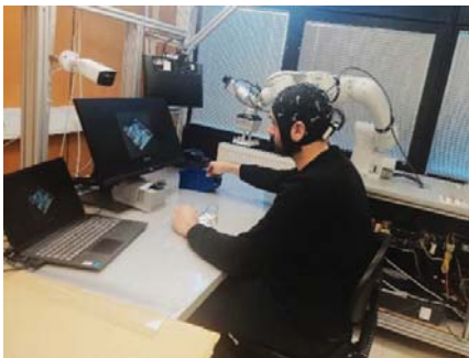
Fig. 2. Collaborative Scenario: the participant performed the task with the robot. The components were carried by the robot to the candidate, while the participant perform the current assembly task.

The two experimental scenarios were set in two different periods of the year with a time span of minimum 6 months to reduce the error-bias in the comparative neuroergonomic analysis between standard and collaborative scenario. The two scenarios were set up in the laboratory of FINK.